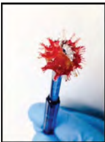
Brush head with tissue trapped between bristles