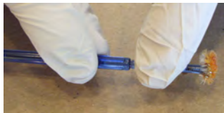
Separating head of device from handle