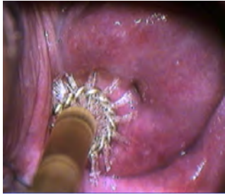
SpiraBrush CX ® being applied, pressed and rotated gently.