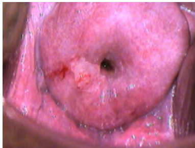
Micro-punctate bleeding at the brushed biopsy site